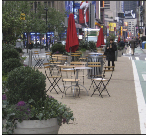
Pedestrian mall along Broadway

The biggest neighborhood news in 2009 has been the wonderful pedestrian mall on Broadway from 59th Street to 33rd Street. This "Green Light for Midtown" is one of the most exciting